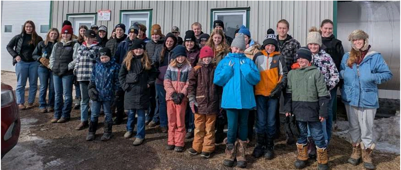
Photo: IAT participants at Tranquillity Agriculture during the 2025 IAT.