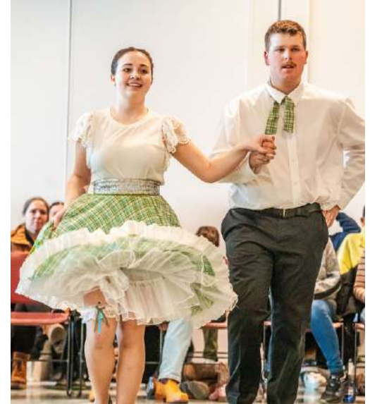
Photo: Couples from Lachute and Shawville dancing at the 2025 Competition.