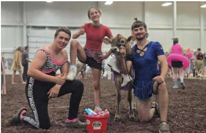
Gagnants génisse costumée : Le CJR Bas-St-Laurent a remporté ce concours avec leur performance de patinage artistique.