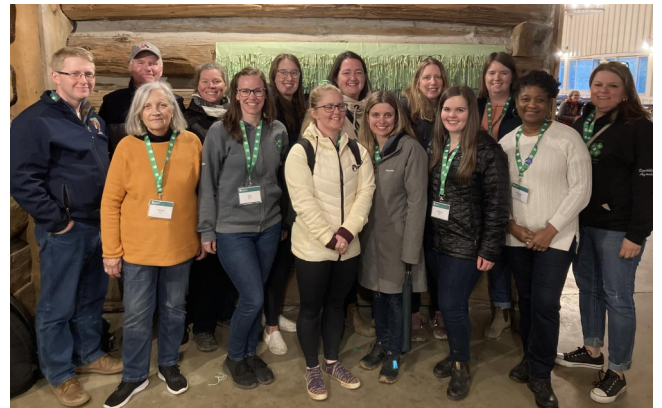
Quebec 4-H Delegates Unpacking Positive Youth Development and More ( Photo at visit to Saunders Farm)