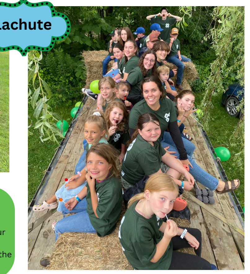
The News Spreader - August 2024 - Quebec 4-H

The Lachute 4-H Club participated in the parade on Thursday night and sold ice cream all weekend long in our ice cream booth! Members participated in the 4-H Dairy Show on Saturday, the open Dairy Show on Sunday and the Extreme Cowboy Event on Saturday. Fun was had by all!