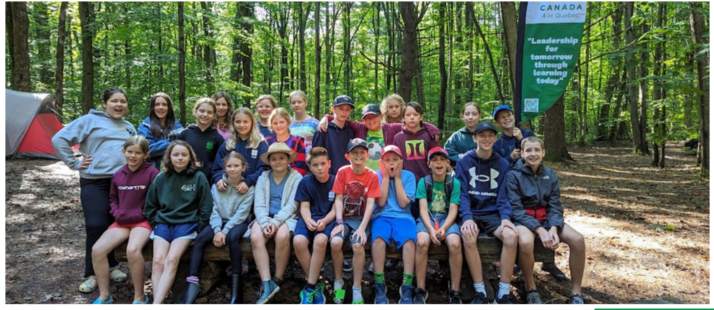
The 4-H Quebec Staff and Senior member chaperones