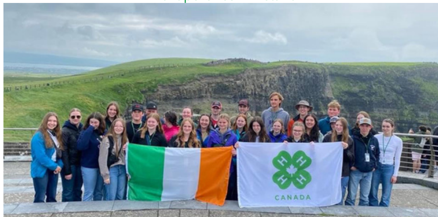
Below - 4-H Canada members and chaperones in Ireland