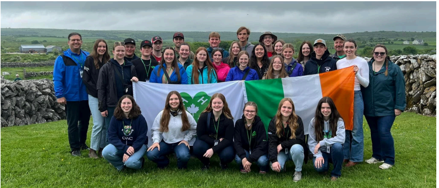
The 4-H Canada members and chaperones in Ireland