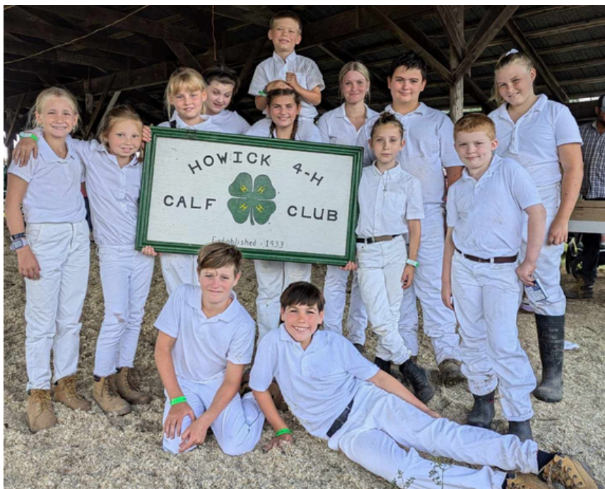
Middle: Howick 4-H Club group photo at their Achievement Day hosted at the Huntingdon Fairgrounds.