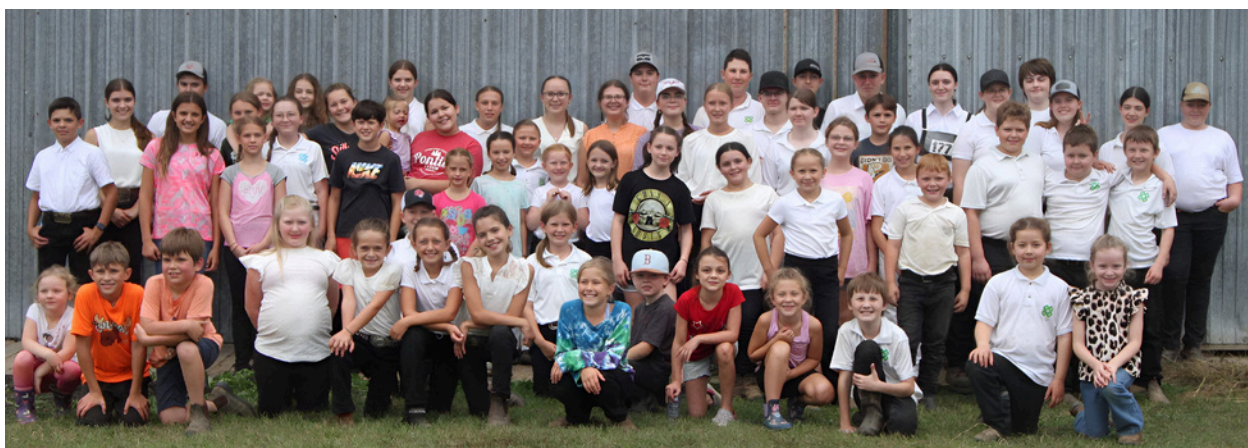
Bottom: Shawville 4-H Club group photo at their Achievement Day hosted at the Shawville Fairgrounds